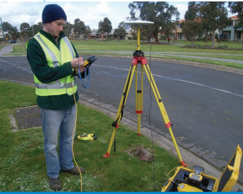
Figure 2: Vicmap Position - GPSnet in action

It has also been supported by the Australian Federal Government.