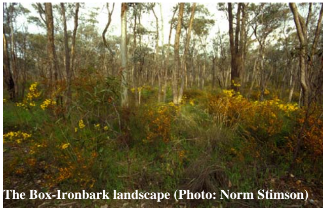
The Box-Ironbark landscape

Bendigo is fortunate to be surrounded by Box-Ironbark forests and woodlands which boast a diverse array of plants and animals as well as Indigenous and European cultural heritage sites.