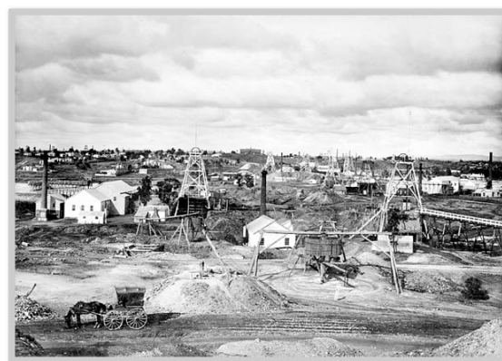
View of Sandhurst from Belmont and Saxby mines, Bendigo, 1888

The gold rush shaped the history of Bendigo. It was discovered here in 1851, bringing thousands of miners to swarm local streams and rivers searching for alluvial gold. When this was exhausted they began mining below the surface for quartz based gold. By 1860, the goldfields had changed from small operations to major mines with deep shafts.