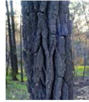
Red Ironbark

Certain thoughts spring to mind when the words Box-Ironbark are mentioned. The dark and deeply furrowed bark of the ironbark trees, the light flaky appearance of box trees, golden wattle flowers and the sound of twigs and leaves crackling on the dry forest floor beneath your feet. The vibrant array of wildflowers, the chatter of parrots, flocks of sweet singing birds, the rich aroma of eucalyptus oils and nectars, along with the striking contrasting trunks of the Box and Ironbark trees offers a charm unique to these forests.