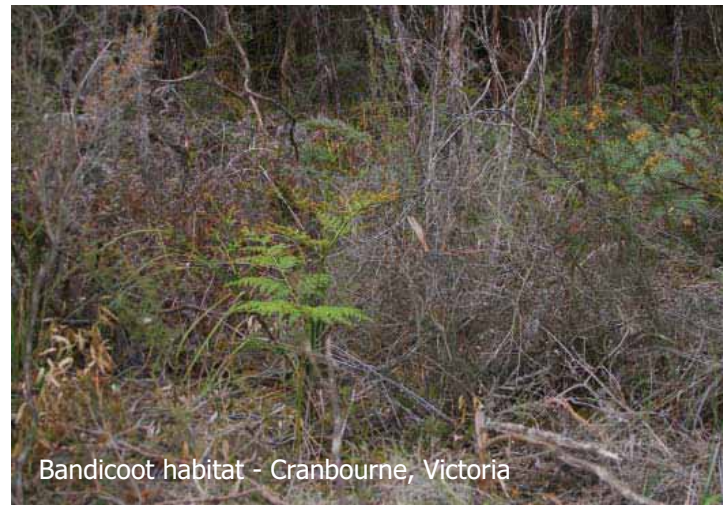
Bandicoot habitat - Cranbourne, Victoria

Southern Brown Bandicoots are about the same size as small rabbits with a long, pointed snout, small eyes, rounded ears, a compact body, large rump and sparsely furred short, thin tail approximately half of the body length. Front and hind feet are strongly clawed. Fur is coarse, greyish or yellowish brown above with a whitish belly.