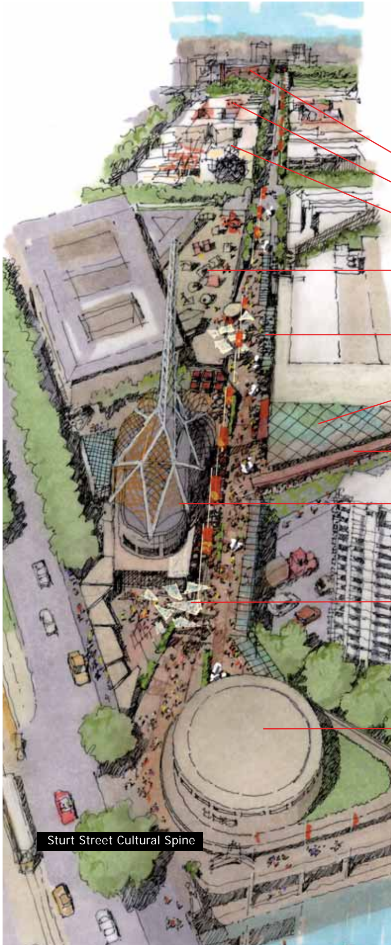
Sturt Street Cultural Spine