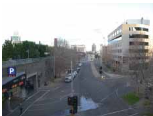
Above: Existing view along Sturt Street from the Arts Centre podium