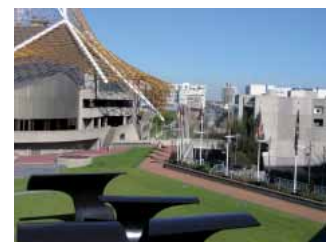
Existing view along Sturt Street from the top Hamer Hall balcony

Develop the vacant site at the corner of City Road and Sturt Street as an exciting new arts facility, possibly a music centre and base for the Melbourne Symphony Orchestra (MSO).