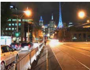
Existing view along Sturt Street to the Arts Centre podium and City

Right: Night view up Sturt Street to proposed pedestrian ramp connection to the Arts Centre Plaza