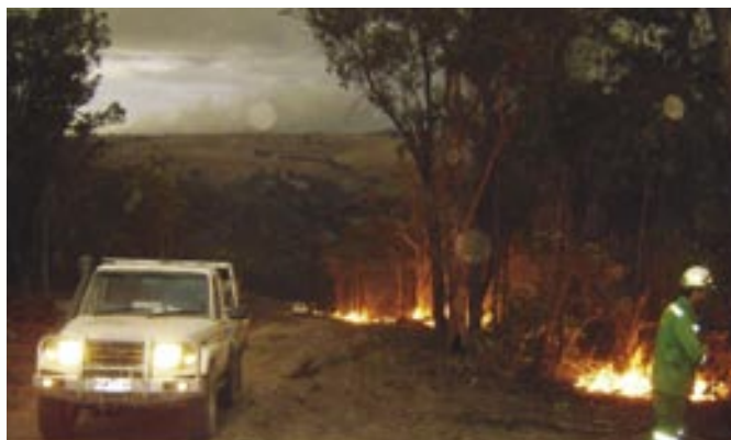
Dale Stokes from the Urban Development Program in a late afternoon back burning operation