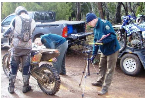
DSE officers conducting noise testing in preparation for the Enduro

DSE recently attended the Portland Green Triangle Enduro and provided riders with some background to the DSE trail Bike Project. DSE also tested competitors bikes for compliance with the 94dBA allowable noise limit.