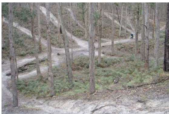
Trail bike single-tracks that are proposed for closure in Enfield State Forest.